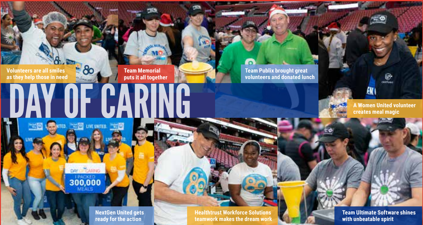
Volunteers are all smiles as they help those in need