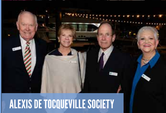
ALEXIS DE TOCQUEVILLE SOCIETY