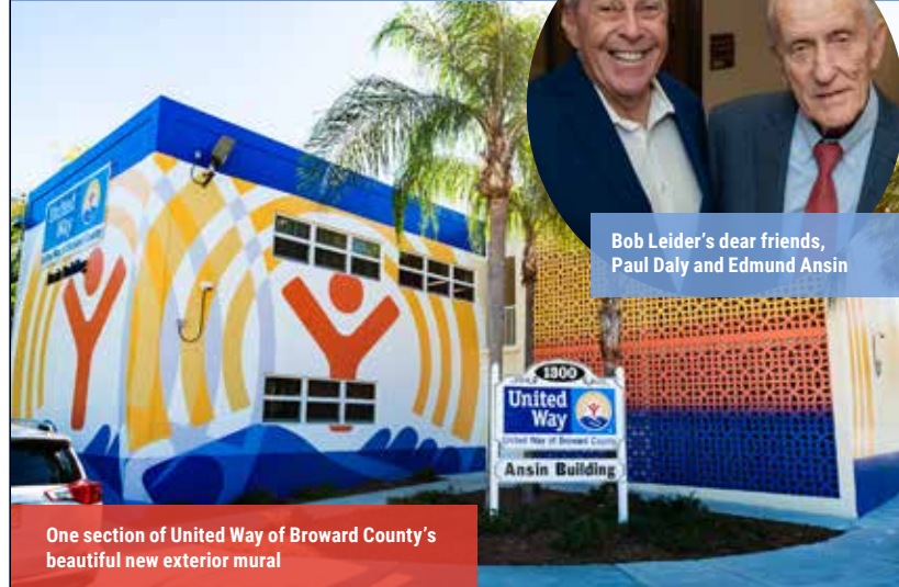
One section of United Way of Broward County's beautiful new exterior mural