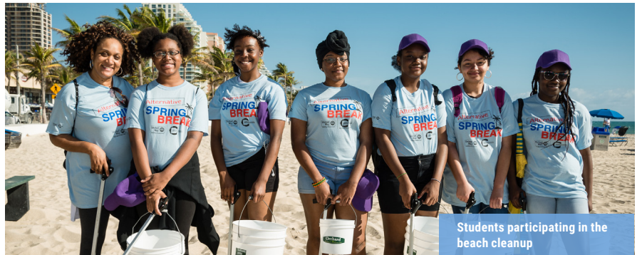
Students participating in the beach cleanup

On Monday, students attended a professional development and networking event where they heard from United Way of Broward County