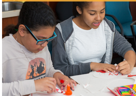
Students decorated heart shaped art with inspirational messages for Marjory Stoneman Douglas High School

HOSTED BY UNITED WAY OF BROWARD COUNTY COMMISSION ON BEHAVIORAL HEALTH & DRUG PREVENTION'S BROWARD YOUTH COALITION