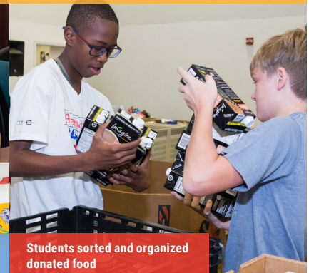
Students sorted and organized donated food